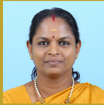
ROSHNI L PROJ